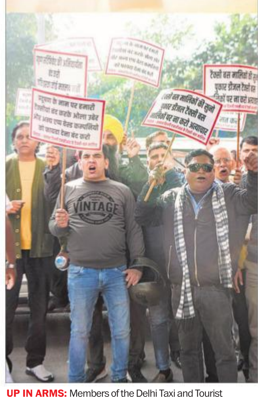
UP IN ARMS: Members of the Delhi Taxi and Tourist Transporters Association protest the ban on the plying of BS-3 petrol and BS-4 diesel four-wheelers in Delhi-NCR under the Graded Response Action Plan, in New Delhi on Thursday.