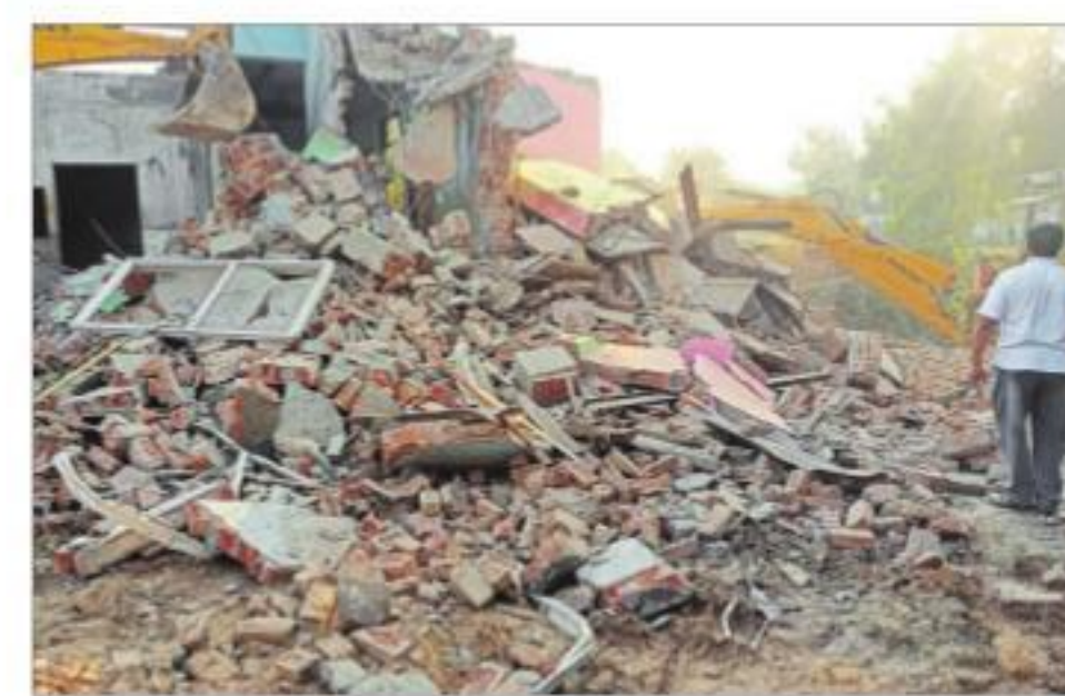
The illegal house of a drug smuggler being razed in Bhainsrawali.